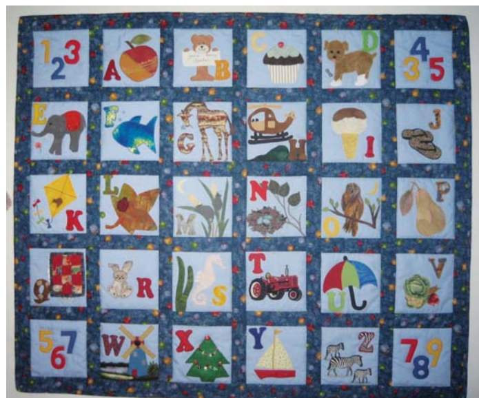
Quilt donated to the children of the Safe House from the Patchwork Quilt Club of North Canterbury.